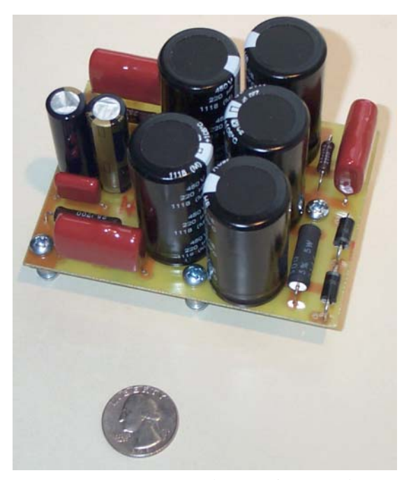
SCA-35 Power Supply Capacitor Board