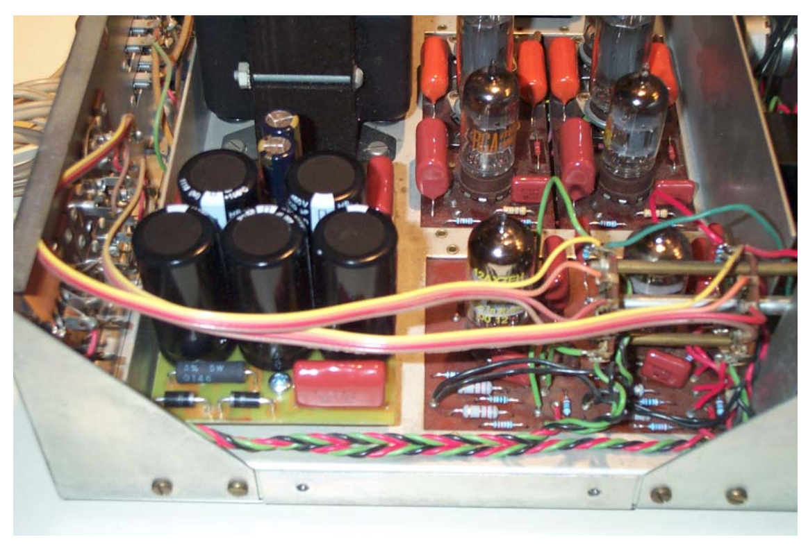
Capacitor Board Installed in Amplifier