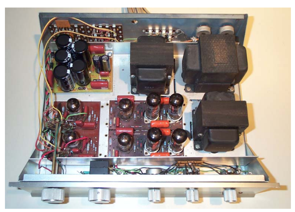
Cap Board Installed in a SCA-35 (another view)