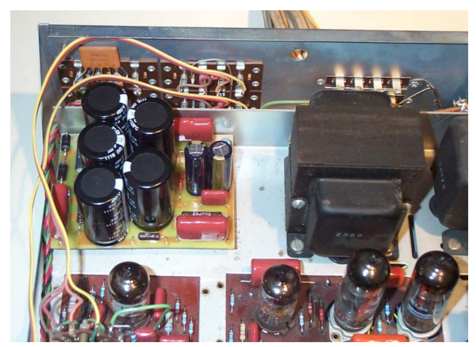
Cap Board Installed in a SCA-35