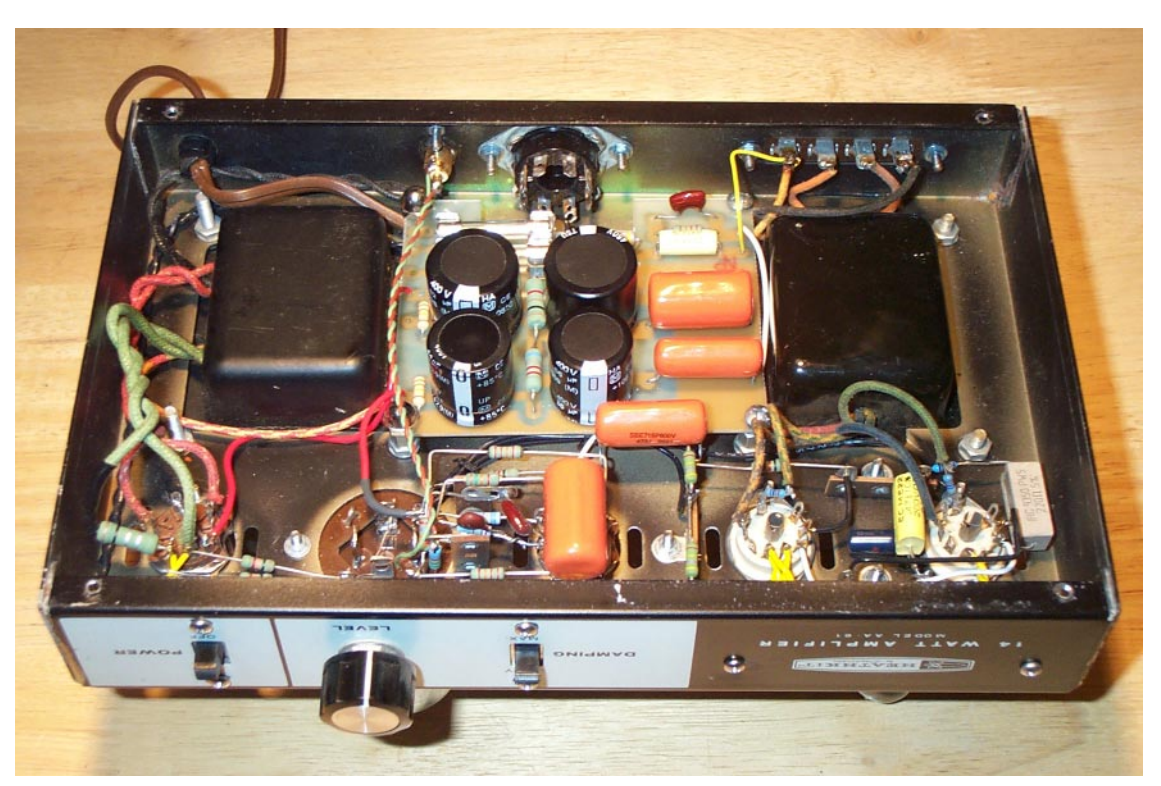
Capacitor Board Installed in Amplifier