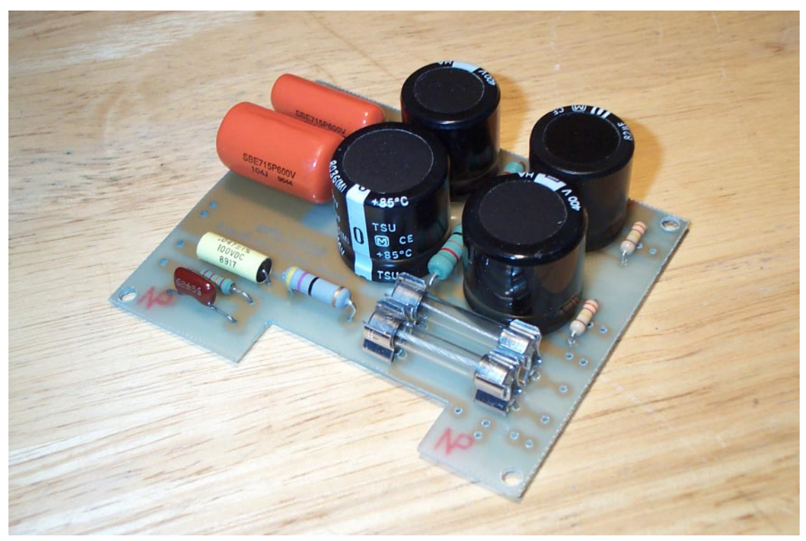
Heath UA-1 (UA-2 or AA-61) Power Supply Capacitor Board