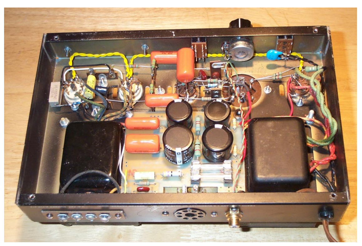
Capacitor Board Installed in Amplifier