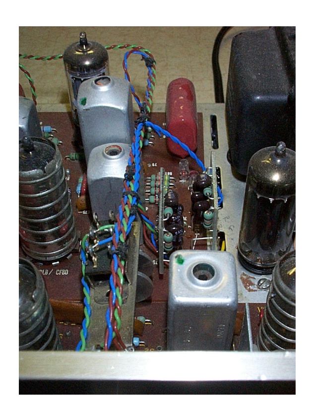
Figure 2: New PEC boards in a Dyna FM3