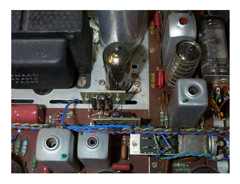
Figure 1: New PEC boards in a Dyna FM3