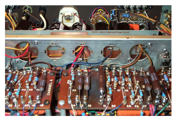
Capacitor Board Installed in Amplifier