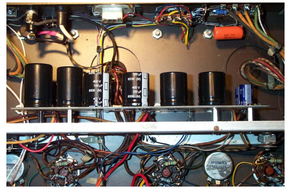
Capacitor Board Installed in Amplifier