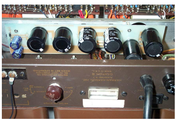
Capacitor Board Installed in Amplifier